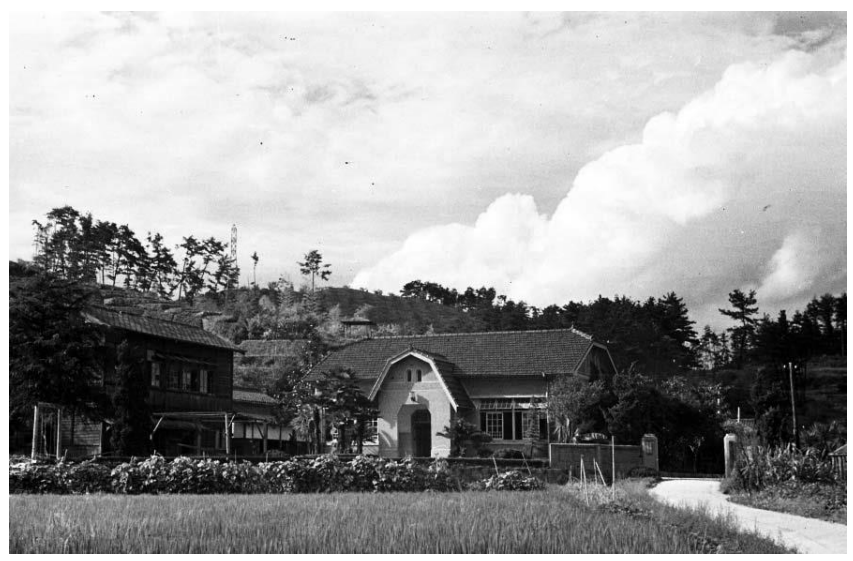
The Hiroshima Institute for War Children established in the Hiroshima Agricultural Experiment Center site