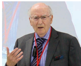
Keynote Speaker: Professor Philip Kotler