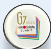
Pin badge with registered information; ICE Tag®