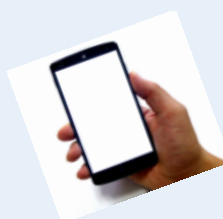
Medical institutions and emergency services can access the information using a dedicated app